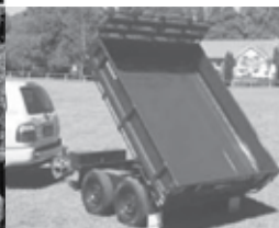
Tandem Hydraulic Tipping Trailer (9x6)