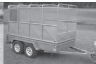
Tandem Box Trailers