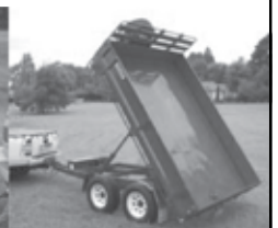
Tandem Hydraulic Tipping Utility Trailer (10x7)

Telephone: (02) 4861 1400 Website: www.deantrailers.com.au Telephone for a free brochure