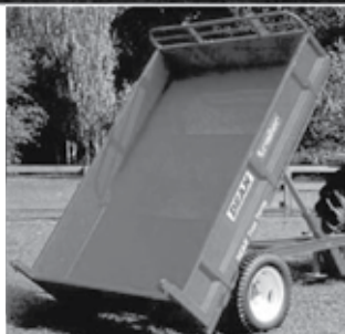
3 tonne Mark II Hydraulic tipper

Quality manufacturer using new Australian made steel, providing a diverse range of on-and-off road trailers in all shapes and sizes.